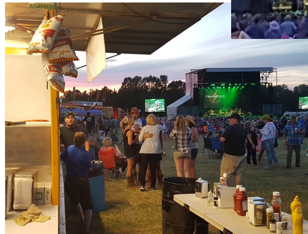
Looks like a good crowd and lots of good music!