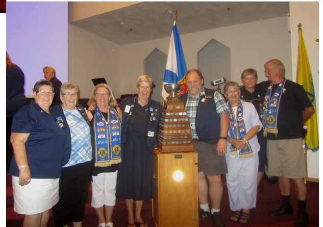
Antigonish Lions Club won the Rose Bowl, congratulations!