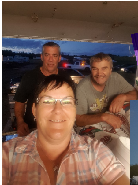
Friday night crew.